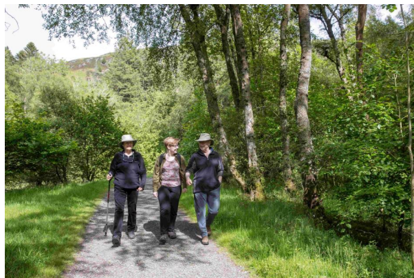
1 - Penbont Woods, Elan Valley