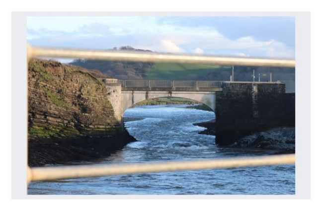
4 - <u>Ceredigion communities encouraged to "adopt" their local rivers</u>