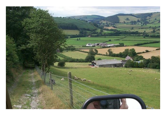
3 - Born and bred in Radnorshire

Too many to mention! Generally, the emergence and acceptance of regional economic development within Wales – and Mid Wales as its own separate, distinct economic region – is the key development. From that, many other developments flowed – including the Mid Wales Growth Deal and the Mid Wales Regional Skills Partnership (RSP). Regional working has progressed A LOT in the last seven years, and the volume of work we now do as GMW is testament to that.