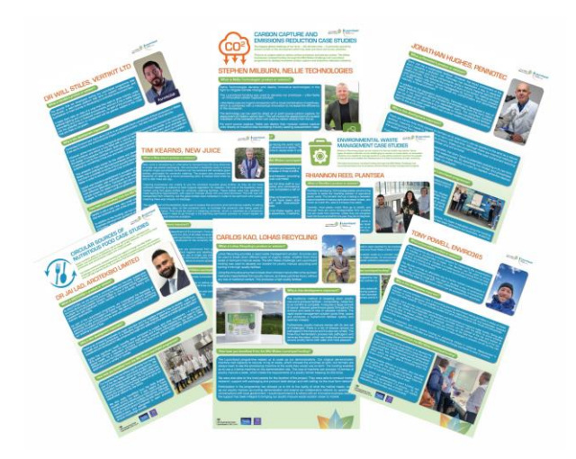
1 - AberInnovation Launchpad Case Studies