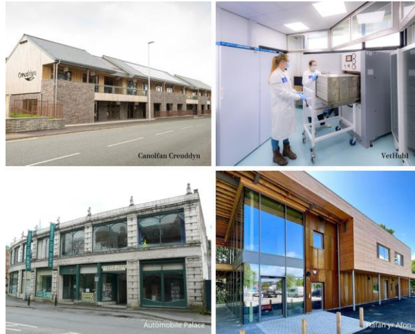
2 - Infrastructure projects in the region. (From top left to bottom right) Canolfan Creuddyn, VetHub1, Riverside Venue in Newtown, and Automobile Palace, Llandrindod Wells.

Another example of Welsh Government funding to help support local company expansion in Powys is the development of Abermule Business Park . Having been earmarked for industrial development within the Local Development Plan, for over 20 years, the site is specifically allocated for small and medium sized employment opportunities and will capitalise on the county's main road and transport infrastructure. The site will also use renewable and low carbon energy sources.