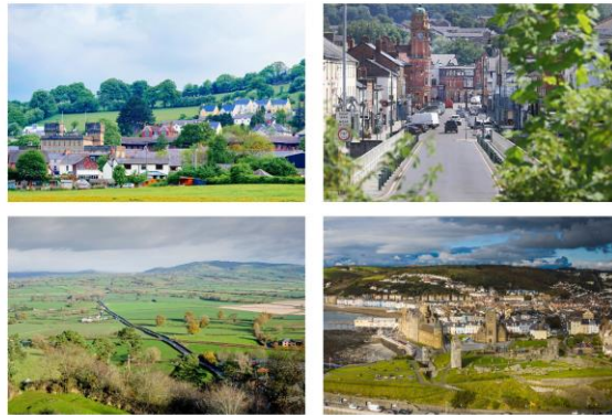
(L-R clockwise) Brecon, Newtown, Aberystwyth, Powys landscape

It is widely acknowledged that there is a lack of good quality employment sites and premises to meet business requirements and expectations in Mid Wales. There is minimal activity in terms of speculative building of such sites by the private sector due to market failure. An ageing stock of premises exists that require significant investment to become an attractive proposition.