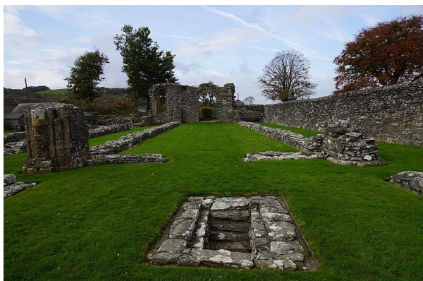
4 - Holy Well, Strata Florida, Ceredigion

The Strata Florida Trust have evidenced that the current Abbey was laid out over a pre-existing holy well which may date back to a Dark Age, Pre-Cistercian Celtic monastery.