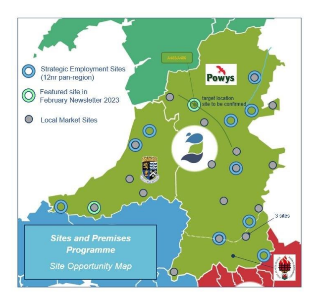
1 - Site Opportunity map

There is a recognised lack of availability and investment in modern and technical employment premises across the region with low levels of speculative development and issues of commercial viability in provision. Market failure drives an estimated viability gap of \sim 60\% .