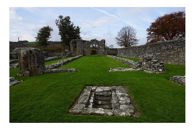
4 - Holy Well, Strata Florida, Ceredigion

The <u>Strata Florida Trust</u> have evidenced that the current Abbey was laid out over a pre-existing holy well which may date back to a Dark Age, Pre-Cistercian Celtic monastery.