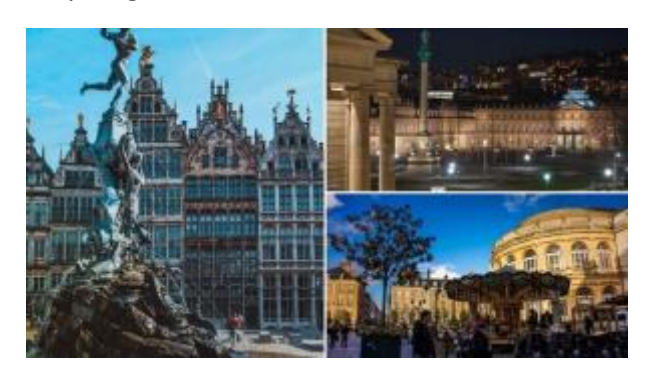
4 - Stuttgart, Rennes, Antwerp

For further information or to discuss a proposal, please contact the Welsh Government Horizon Europe Unit via HorizonEurope@gov.wales.