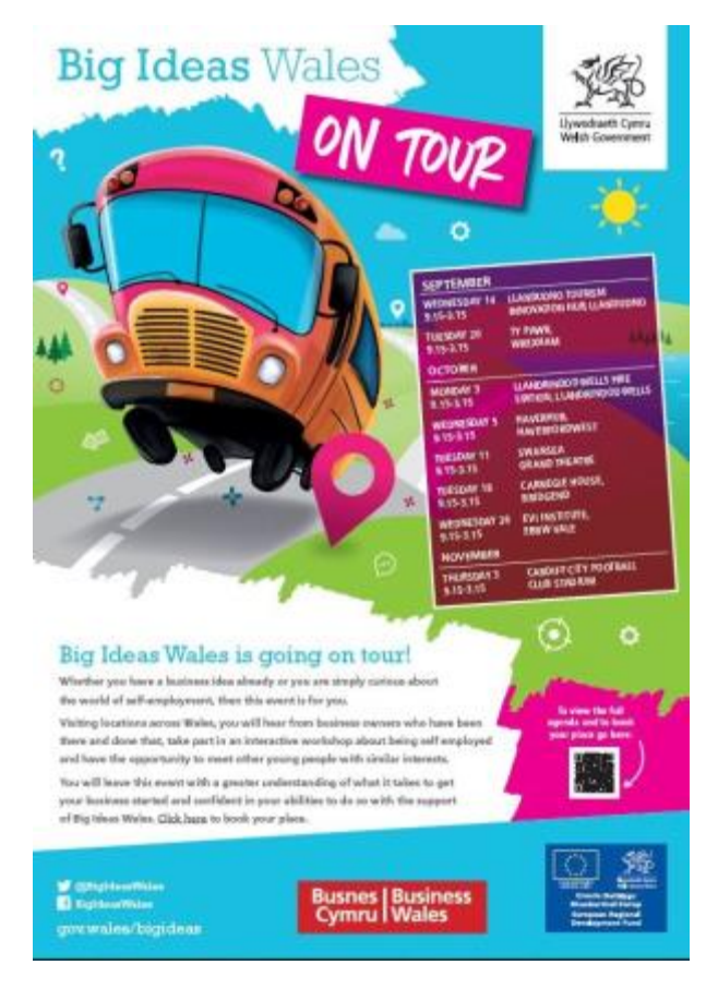
3 - www.gov.wales/bigideas