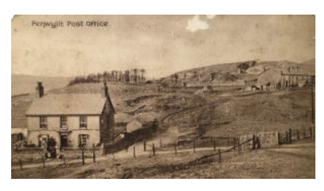
1 - Courtesy of Powys Archives collection. Catalogue no. B/X/136/P/9

For more historical images and interesting facts on Powys, follow Powys Archives on Facebook, Twitter or Instagram.