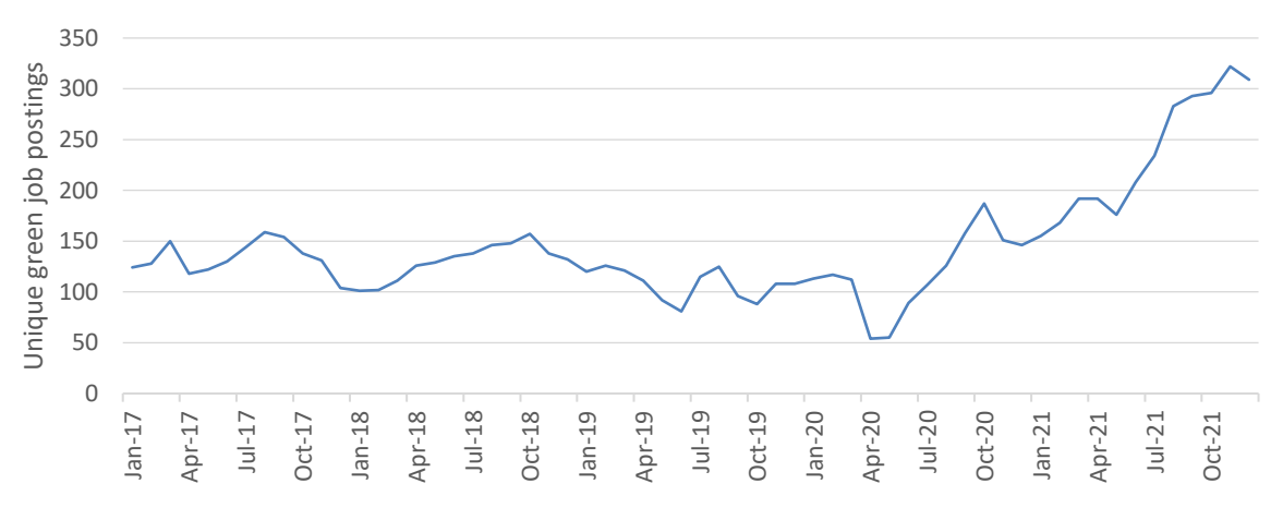
Figure 2 - Number of unique green job postings, by month, Wales, January 2017 - December 2021