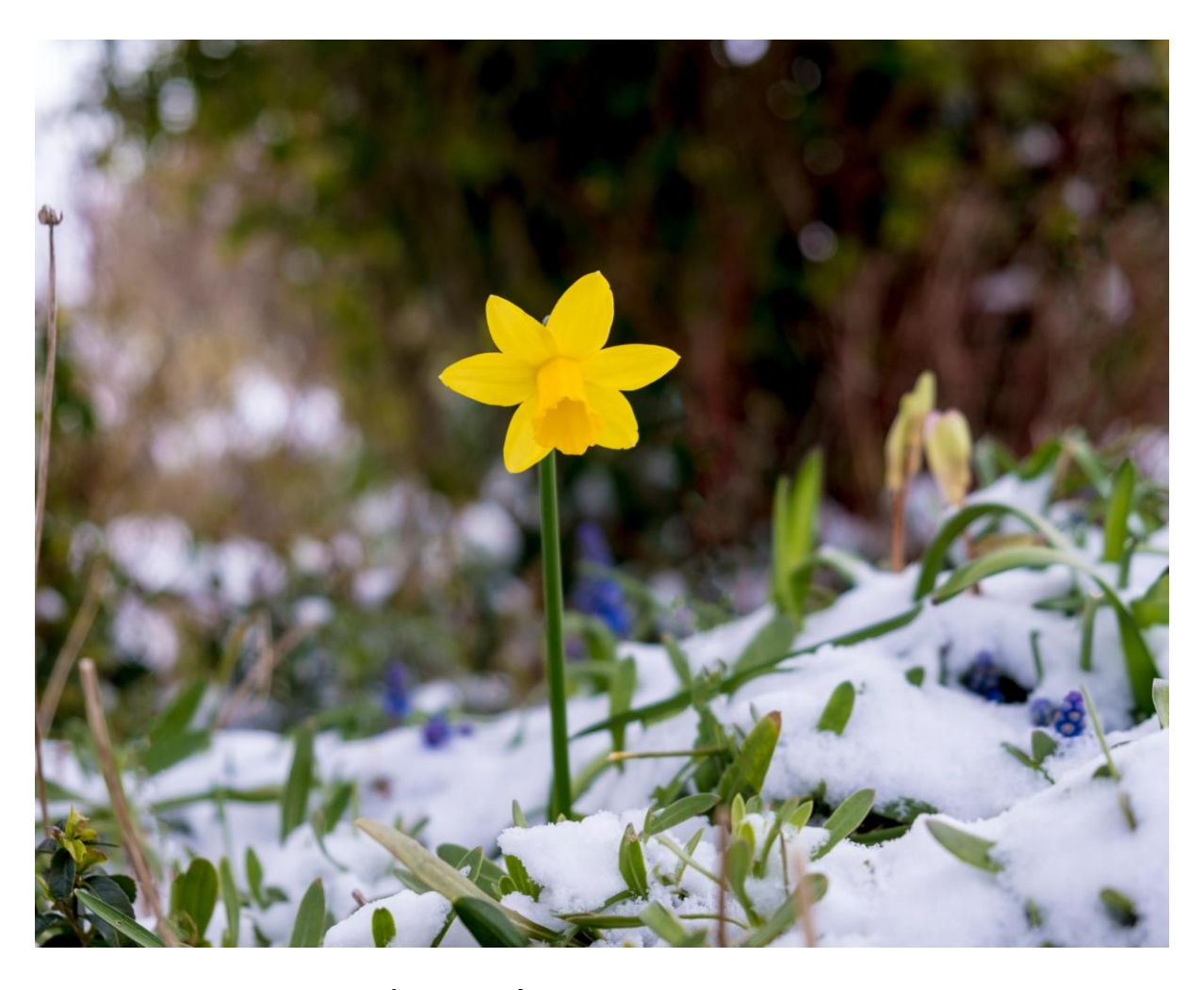
Growing Mid Wales March Newsletter